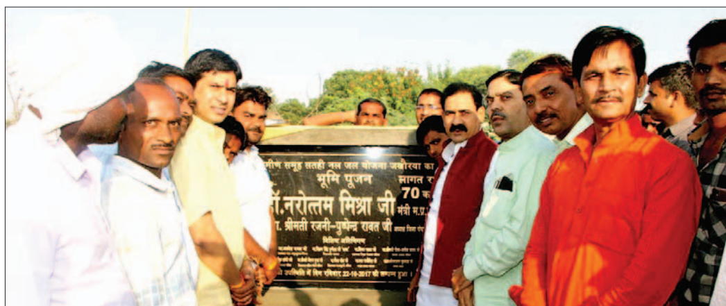
Public Relation Minister Dr Narottam Mishra laid foundation stone of Nal-Jal Yojana at Murera village in Datia on Sunday.