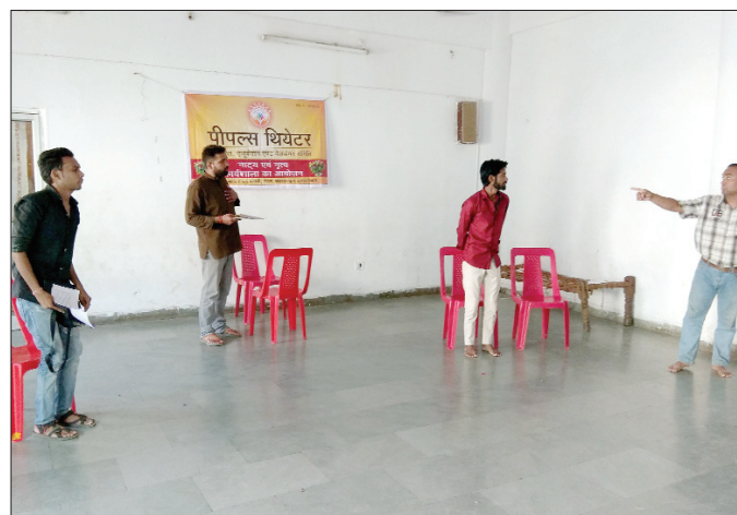
One of the scenes of theatre workshop at Mayaram Surjan Bhawan, on Sunday.